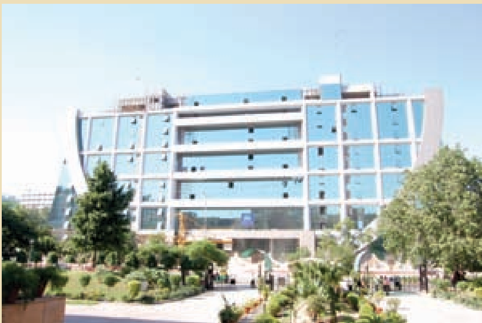
The upcoming CBI Headquarter Building in New Delhi